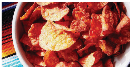
Spicy Mango Chili Lime Kettle Chips

MicroDried Mangoes are certified Ready-to-Eat and seamlessly integrate into a variety of applications including trail mix, seasonings, baked goods, snack/nutrition bars, dairy, beverages, and more.