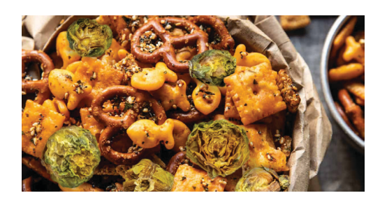
Cheesy Garlic Veggie Snack Mix

MicroDried Brussels Sprouts are certified Ready-to-Eat and seamlessly integrate into a variety of applications including trail mixes, pet food, nutraceutical powders, seasonings and more.